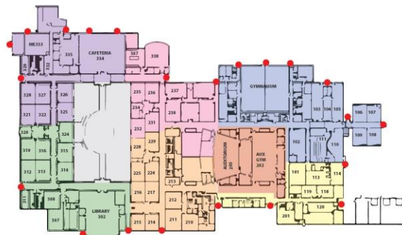
2 - Updated Unami Map for ALICE security.

9th grade students who have previously participated in Link 2 Unity and have expressed interest in leadership training will participate in leadership training activities planned and run by CB South First Link students. We are developing future CB South leaders!